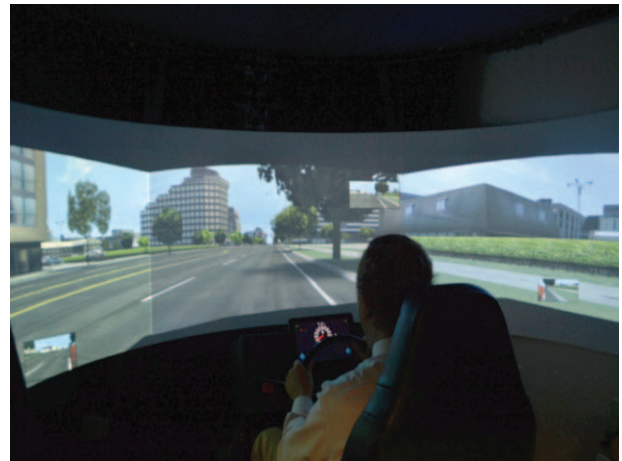
Fig. 1. Driver Guidance System: a high-fidelity immersive driving simulator.

Before each simulated driving experience, all residents underwent PVT testing. PVT is a 10-min computerized test that evaluates sustained attention and reaction time and measures lapses, both minor (less than 0.5 s) and major (0.5 to 1.0 s) in response, after randomly occurring visual stimuli. 16–18 After an opportunity to practice the PVT, residents sat in a quiet, well-lit room with a laptop on the desk in front of them and were instructed to push the space bar